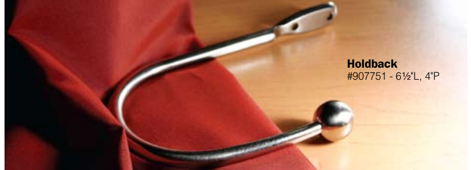
Holdback #907751 - 6 1/2"L, 4"P