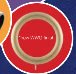
*new WWG finish