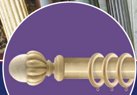
*new white wash gold finish (WWG)