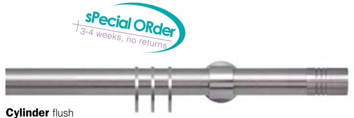
Cylinder flush ▼ #281331 - 1 1/8"W, 1 1/8"L *shown in stainless steel (SS)