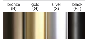
Aluminum Tubing ▼ #288060 - 1 1/8"D

*sold by the foot but may be cut to specified lengths, no charge