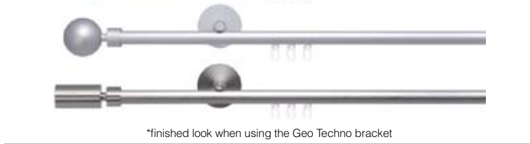
*finished look when using the Geo Techno bracket