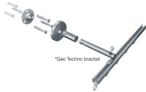
*Geo Techno bracket